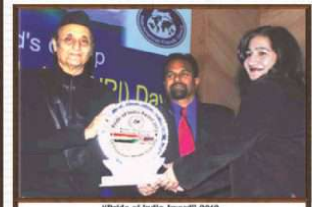
"Pride of India Award" 2012, by Kunwar Natwar Singh, Former Minister of External Affairs of India