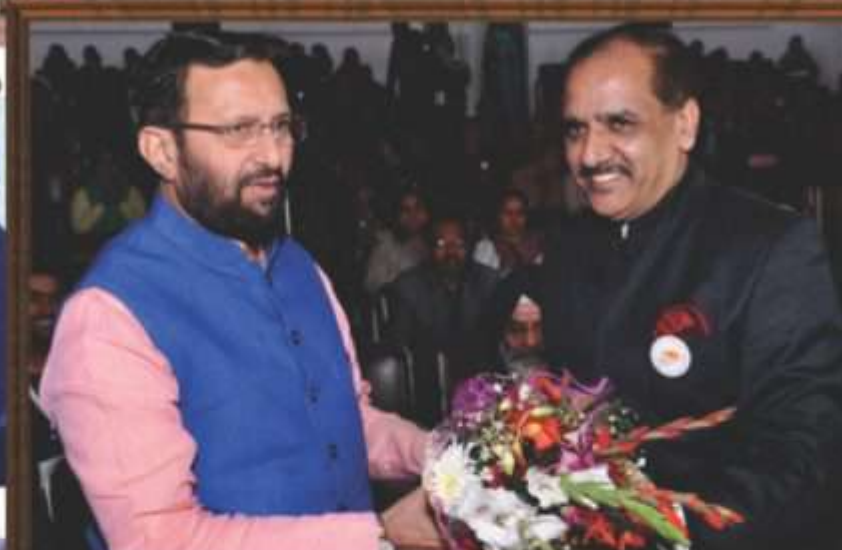
Shri Prakash Javadekar (Minister Human Resource Development of India)