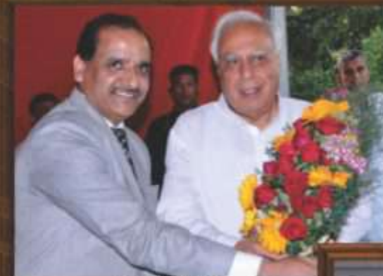
Mr. Kapil Sibal (Former Minister Human Resource Development of India)