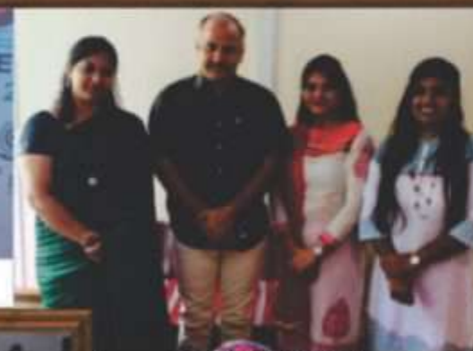
Mr. Manish Sisodia (Deputy Chief Minister, (Education Minister), Delhi)