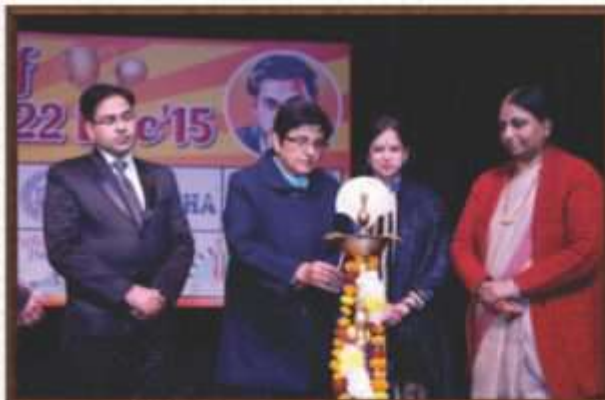
4 th National Maths Symposium 22 nd Dec'2015 at Sirifort Auditorium, New Delhi