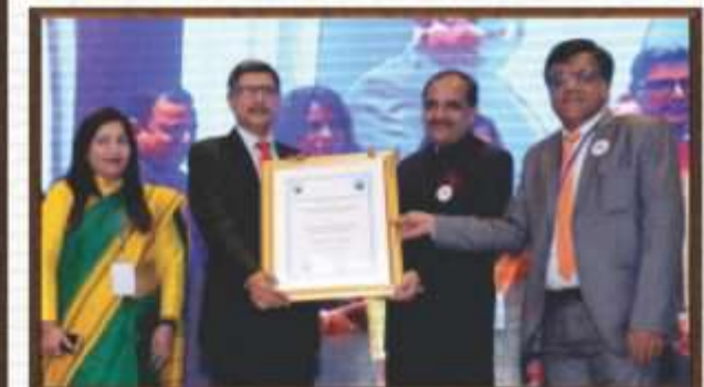
Accreditation by NABET under QCI at Constitution Club of India, New Delhi