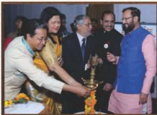
5 th National Maths Symposium 22 nd Dec'2016 at Constitution Club of India, New Delhi